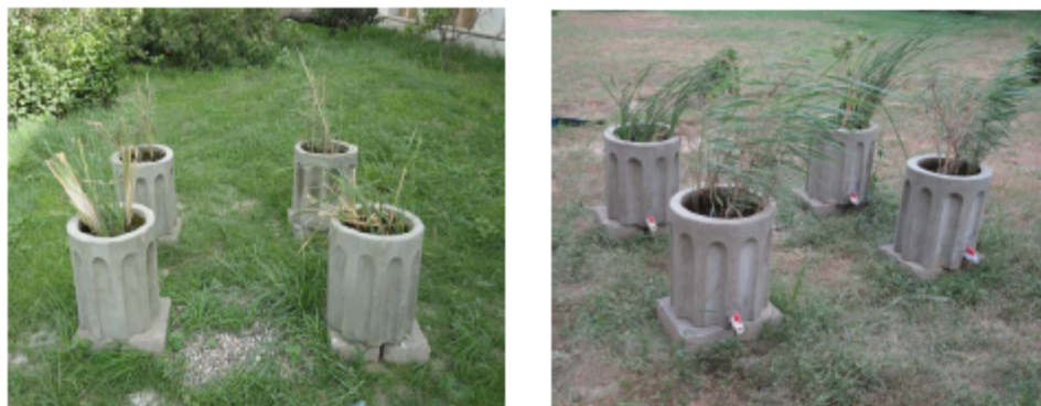
Figure 1. Vertical Flow Constructed Wetlands CW (a) initial plantation period (b) during acclimatization period.

water was added regularly to supplement water losses by evapotranspiration. After one month of establishment, refinery wastewater was fed to pilot scale CW in order to acclimatize the plants. The plants grew well during the acclimatizing period from 0.6 m to 1.5 m (Figure 1b). The primary treated refinery wastewater was transferred from a refinery located in Karachi, Pakistan to the research site in PVC vessels. The refinery wastewater was added manually. Wastewater was added on daily basis to maintain a hydraulic loading rate of 85 mm/d. CW were operated on a pulse load regime (intermittent and saturated flow mode). Experiments were conducted at Karachi (Pakistan) with a warm humid summer (38°C) and a normal cold winter (10°C).